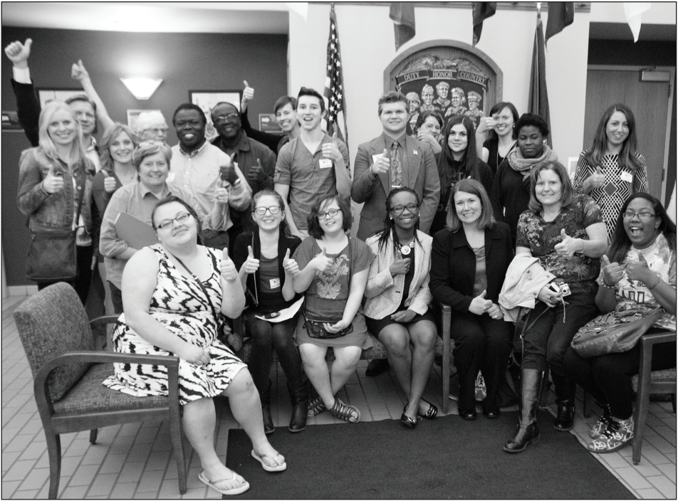
ANSR staff photo

The use of electronic cigarettes in tobacco shops will be prohibited, but four existing businesses are