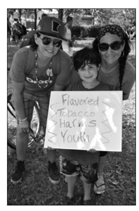
Minneapolis residents helped send a thank you message to the Minneapolis City Council for protecting youth by removing flavored tobacco products from convenience stores and raising the price of cheap cigars.

Every summer, the Ramsey Tobacco Coalition staff get out in the community to educate on the harms of tobacco. This summer was no different. Staff were at many places, including Tater Daze in Brooklyn Park, Twin Cities Pride, Juneteenth and the University of Minneapolis Open Streets in Minneapolis, and Rondo Days and Selby Avenue Jazz Fest in Saint Paul. Anyone stopping by the booths were encouraged to answer questions about tobacco to snag cool prices, such as smart phone wallets, sunglasses, stress balls and pens and pencils.