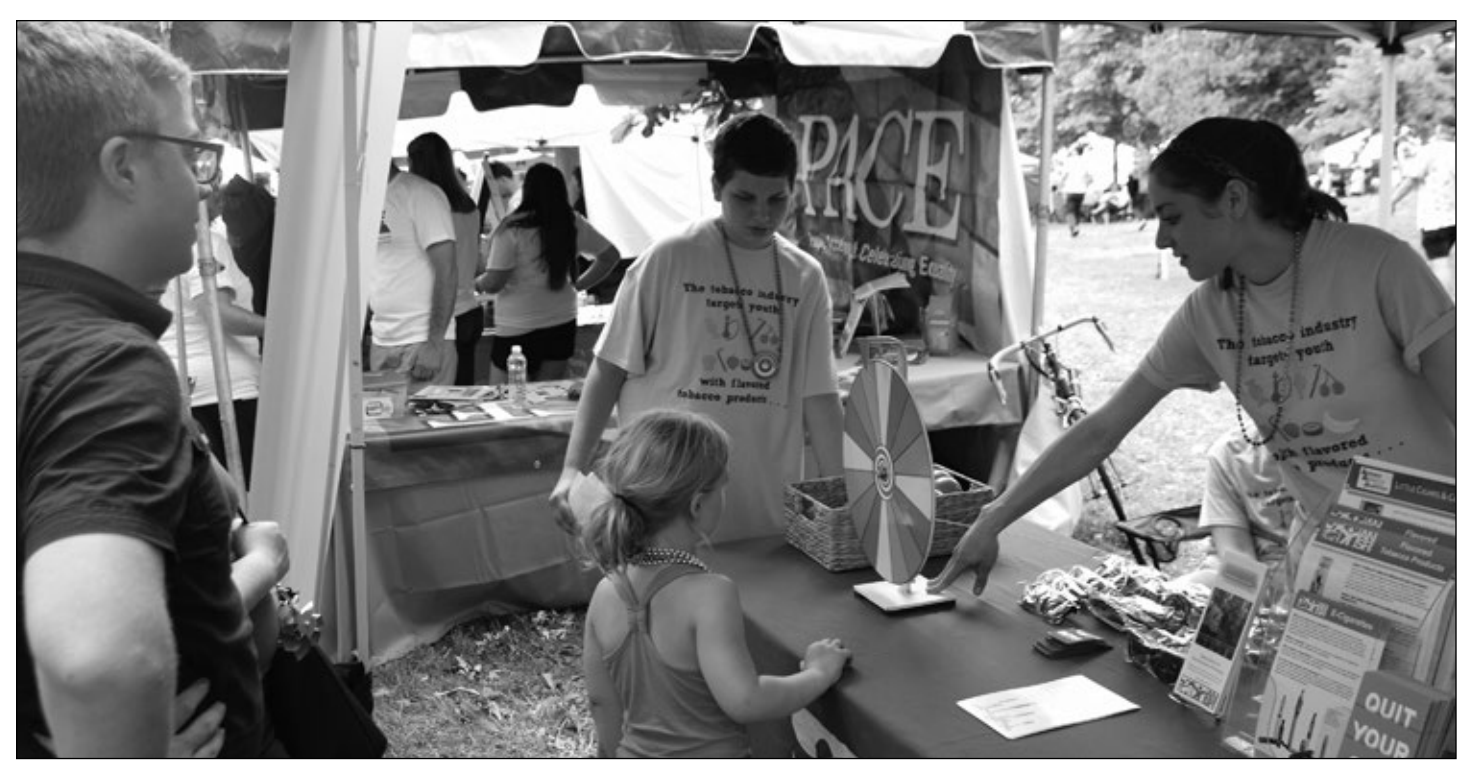
ANSR staff photos