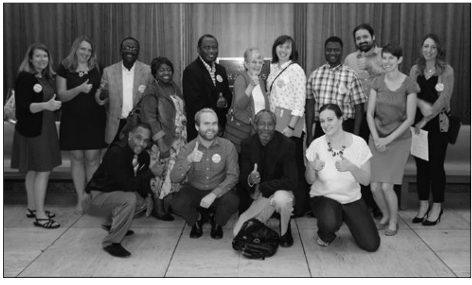
ANSR staff photo