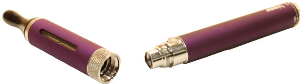
Midsize e-cigarettes can be adjusted and allow users to control the dose of nicotine in the e-juice.

Are e-cigarettes safe? E-cigarettes usually contain nicotine, an addictive drug. Nicotine can be fatal to small children, and poisonings have tripled in the past year. Nicotine side effects include increased blood pressure, joint pain and heart problems. There is no safe level of nicotine for youth. E-cigarettes put youth at risk and damage the developing brains of children and teens. Nicotine is harmful to the health of pregnant women and their developing babies.