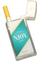
NJoy makes “cigalike” e-cigarettes (above), while APVs (below) don’t look like regular cigarettes.