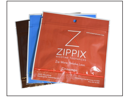
Example of a nicotine toothpick from from the brand Zippix.

Nicotine toothpicks seem to be a recent and bizarre product released by the tobacco industry. In 2020, the FDA had issued a warning letter to <a href="Smart Toothpicks">Smart Toothpicks</a>, another brand of nicotine infused toothpicks, for violating the 2009 Family Smoking Prevention and Tobacco Control Act for not adequately labeling their products with a nicotine warning statement and selling their products to persons under 18. Brands like <a href="Zippix">Zippix</a>, Pixotine, and <a href="Nicotine Picks">Nicotine Picks</a> are selling toothpicks infused with nicotine. These toothpicks are available in a variety of flavors including mint and menthol, cinnamon, butterscotch, mocha. The cost of these products range depending on the quantity. Many of the smaller packs cost approximately $6-$8, whereas larger bundles of 120 can cost approximately $36-$60.