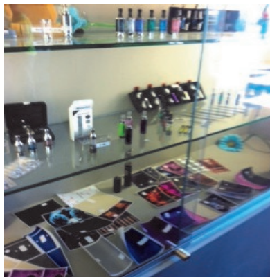
Electronic cigarette accessories

convenience stores and gas stations, usually $5-15 disposable units. Electronic cigarettes are also appearing in tobacco shops.