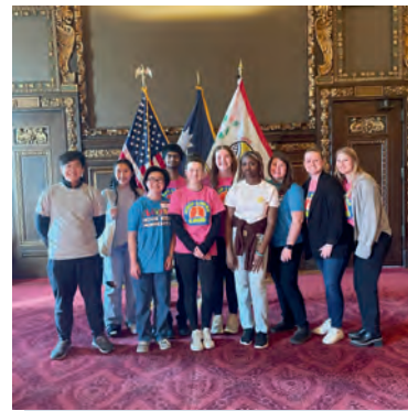
Members of the Ramsey County Student Action Team in Governor's Reception Room