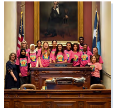
Eagan High School youth advocates in the house chambers