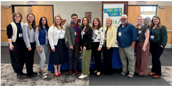
ANSR Staff at the Minnesota Commercial Tobacco Conference

Local and national experts presented on basic prevention messaging and emerging topics at the Minnesota Commercial Tobacco Conference hosted by the Minnesota Department of Health in April, the first such conference in many years. With most in-person meetings vanishing because of COVID 19, this was the first time many people across the state who are working on tobacco use prevention actually met. ANSR staff presented on topics including advocacy strategies in commercial tobacco prevention, price discounting, nicotine-free generation, smoke free-housing, prevention messaging, youth engagement, programmatic frameworks, and vape waste. A conference highlight for many attendees addressed the complex issues of cannabis legalization and how it impacts tobacco policy and initiatives. See a full list of sessions from this year's conference on the MDH website. An amusing juxtaposition was a Philip Morris sponsored conference on another floor of the conference center.