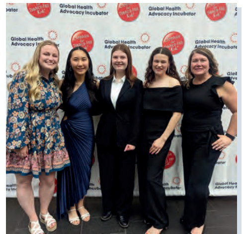
Members of the Ramsey County Student Action Team honored in Washington D.C.

SAT youth were motivated by their experiences watching other teens begin to vape and saw how it dramatically changed their lives. They were tired of locked bathrooms and