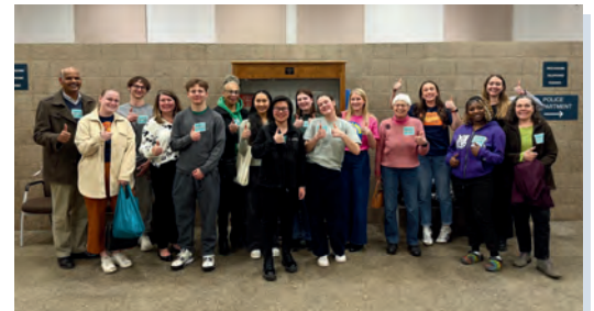
ANSR Staff and Advocates celebrating a win in St. Anthony Village

Thank you to everyone who emailed, called, testified, sent a letter of support, attended a council meeting, and spread the word about this ordinance. Your voice matters in creating important public health policy change!