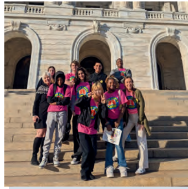
Members of Wash Escapes the Vape in front of the State Capitol ←