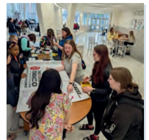
Left: WETV booth for Take Down Tobacco Day