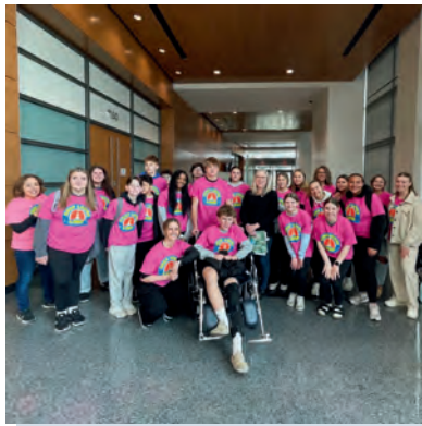
Hastings Middle and High School youth advocates at the State Capitol

ANSR and TFA brought several groups of students and advocates to the state capitol this year. All student groups highlighted the dangers of flavored commercial tobacco products and the urgent need to end their sale, emphasizing how these products are designed to attract and addict young people. By sharing their personal stories and advocating for stronger policies, these youth leaders are making a powerful impact in the fight for a healthier future.