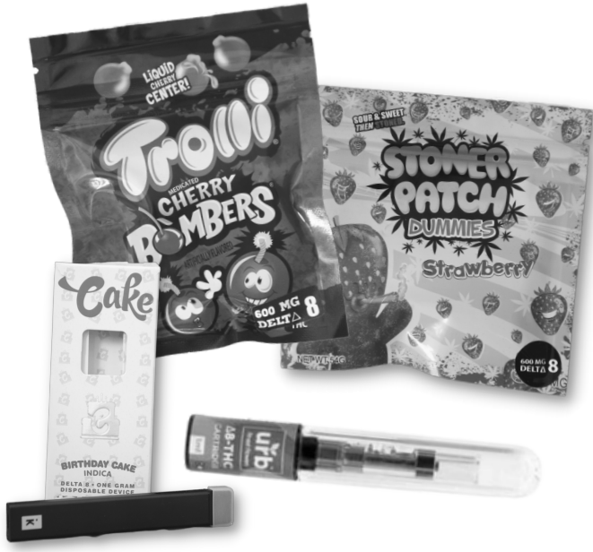
Delta 8 products (bottom to top): Cake Delta8 Disposable Vape, URB Finest Flowers delta-8 product Vape Cartridge 1 ml; Trolli Medicated Cherry Bombers, and Stoner Patch Dummies

Delta-8 is not a tobacco product so many commercial tobacco regulations in Minnesota do not apply to the sale and use of this product. However, the there is some overlap in regulation.