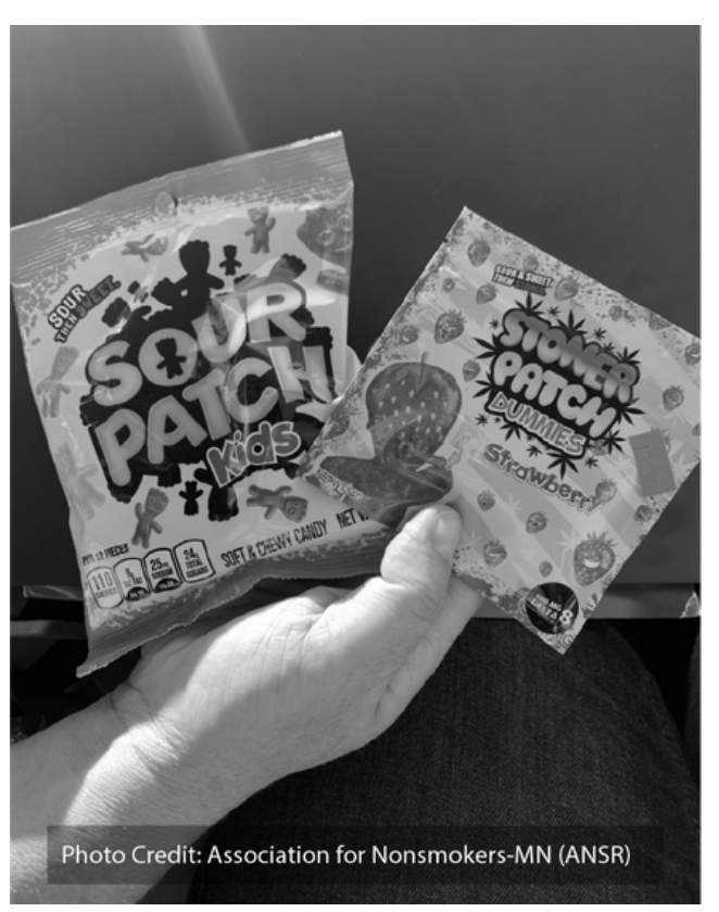
Delta-8 products often mimic popular candy products.

There is no clear statement from any branch of the federal government to say how delta-8 products are regulated.