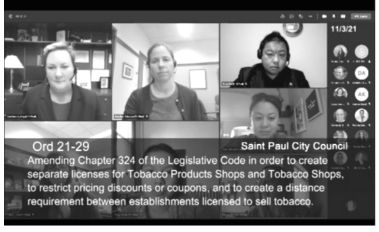
Saint Paul City Council adopted an ordinance prohibiting the use of coupons and price promotions for commercial tobacco and vaping products.

During the meeting, several council members detailed their support for the measure.