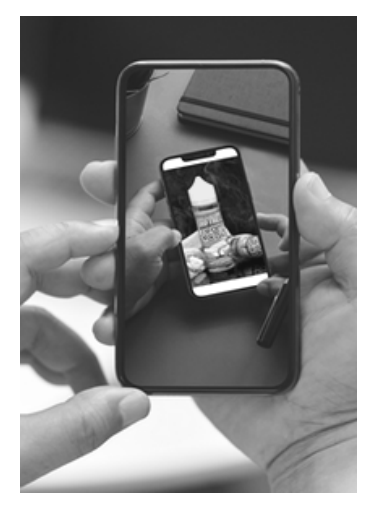
Preventing online sales of vape products is an important policy priority.

flavored e-cigarette products from six online retailers' websites in 2021. We found online retailers often have minimal age verification procedures or none at all. For those sites with an age verification step, youth could easily bypass this process by providing a parent or guardian's birthdate and credit card. The packaging label on the outside of five of the six e-cigarette products ordered required an adult signature upon delivery yet all deliveries were left without obtaining an adult signature. Our study was conducted prior to new federal regulations implemented on October 21, 2021 that prohibits these products from being shipped via USPS. Online retailers can still ship products via private carrier.