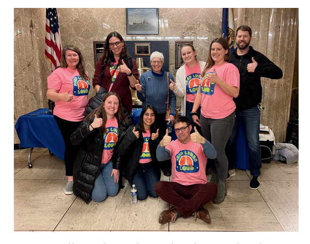
ANSR staff members give a 'thumbs up' after the Saint Paul City Council voted unanimously to remove tobacco vending machine licenses and reduce the number of tobacco retailer licenses on Dec. 13, 2023.

Before the vote, Council President Brendmoen said that some retailers were concerned their licenses might be taken away. While all current license holders will be able to continue to sell tobacco, "If you have [your tobacco license]...revoked for noncompliance, there's not one