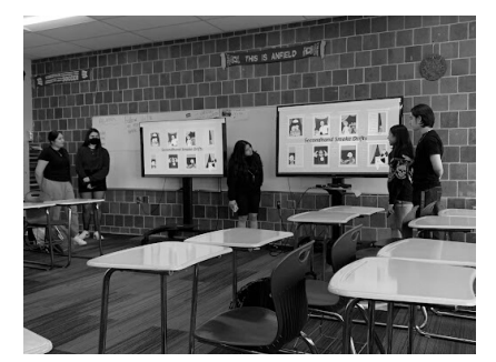
ALMAS students present to leaders from West St. Paul and Mendota Heights.

This spring, students in the ALMAS (Anglos Latinos Motivated to Succeed) group at Two Rivers High School teamed up with ANSR's Live Smoke Free program and Tobacco-Free Alliance to educate local