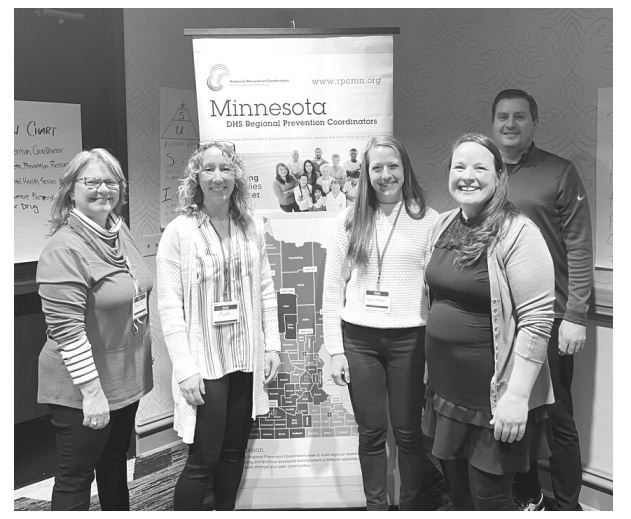
RPCs gather to offer the first in-person SAPST training in three years.

The RPCs enjoyed being able to gather in person to provide training and to learn from prevention partners. More in person trainings are planned for the coming months. To stay up to date with future training opportunities, visit mnprc.org website.